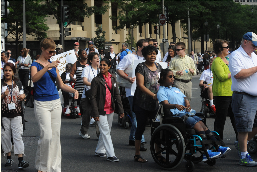
NCIL March to Capitol