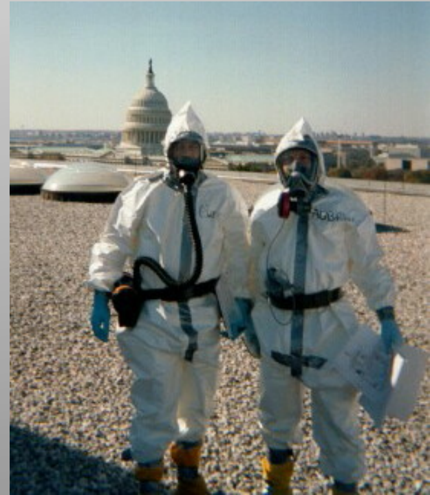
Anthrax Wash DC 2001