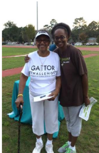
Community Walking Program