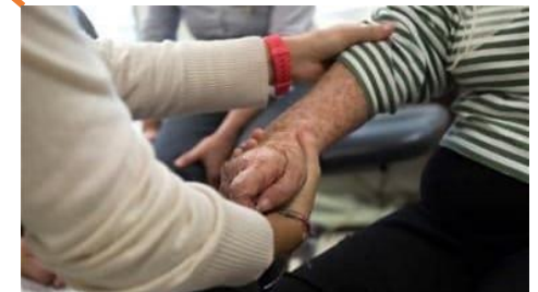
Pro Bono Clinic