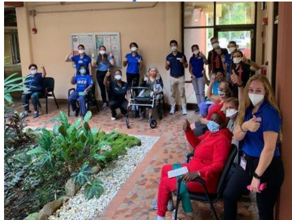
Low Income Housing Chair Exercise Classes