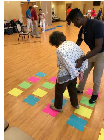
Senior Center Balance & Falls Activities