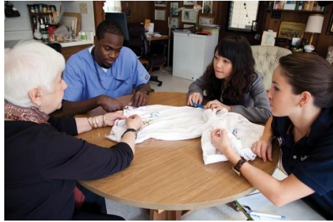
Interprofessional Home Visits