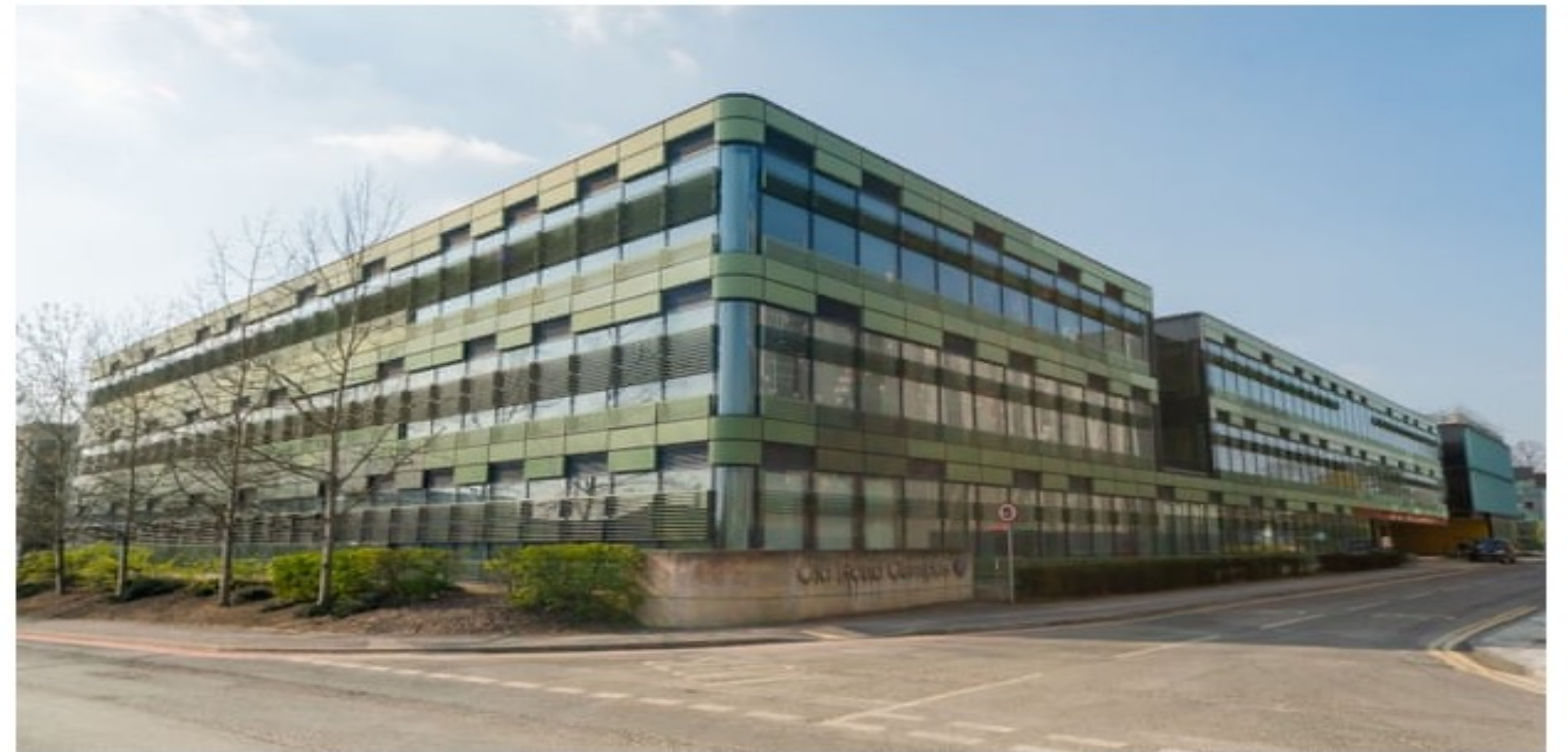
▲ Oxford University's Jenner Institute, one of the hubs of the search for a cure to coronavirus.