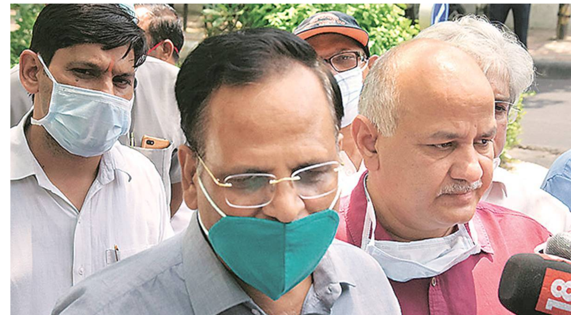
Delhi Health Minister Satyendar Jain speaks to the media