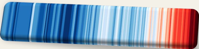
Global Biodiversity 1970-2016