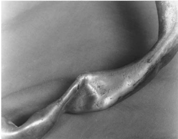
Photo # NH 97570 Brass pipe recovered from USS Thresher debris field, 1963