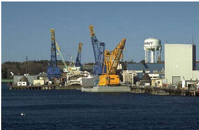
Portsmouth Naval Shipyard