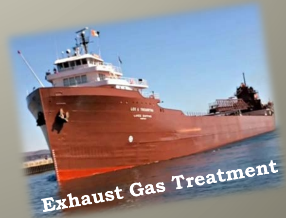
Exhaust Gas Treatment