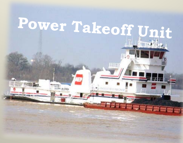
Power Takeoff Unit