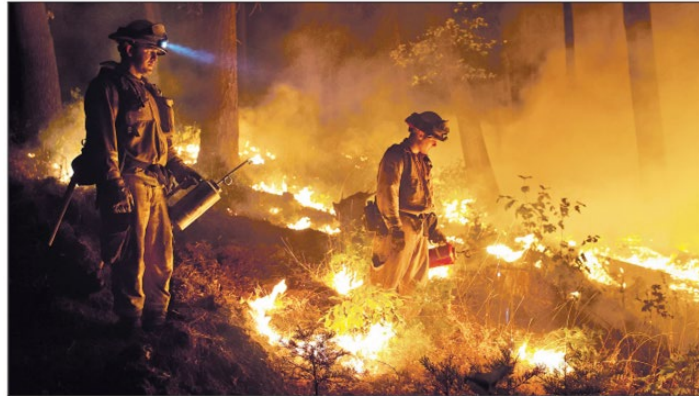
FIREFIGHTERS USE drip torches to set a controlled blaze around homes close to the King fire, burning near Pollock Pines, Calif.

How the U.S. betrayed the Marshall Islands, kindling the next nuclear disaster