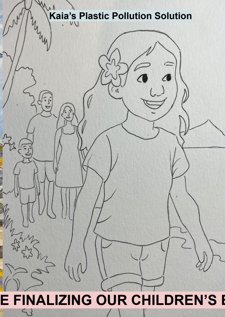
Kaia's Plastic Pollution Solution