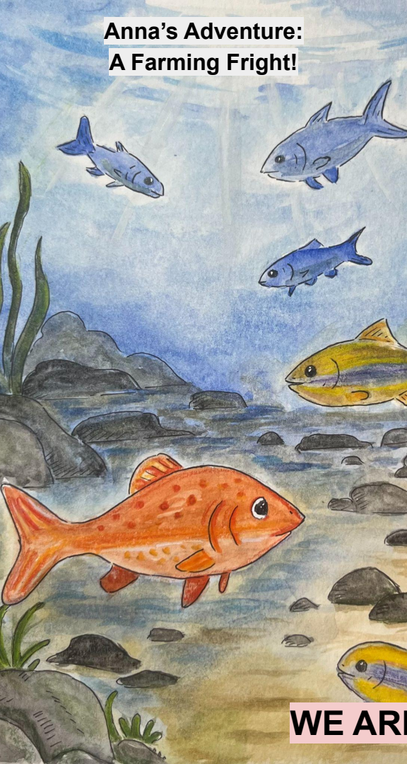
Anna's Adventure: A Farming Fright!