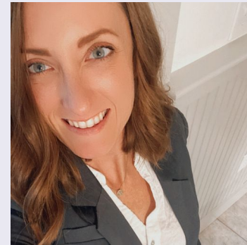
Veronica Woodlief Communications