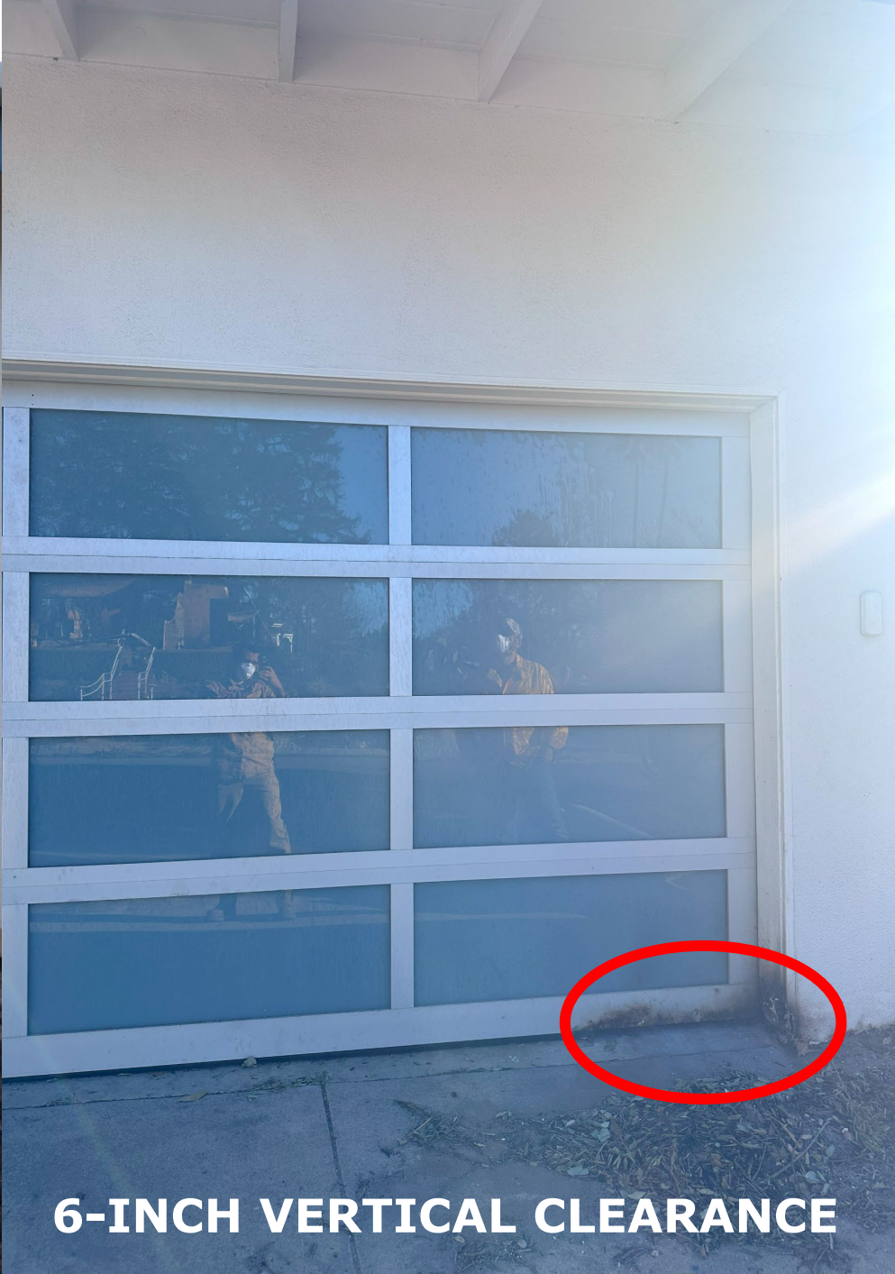
6-INCH VERTICAL CLEARANCE