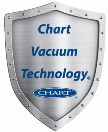
Chart Vacuum Technology® provides the best insulation system to protect product loss and is at the core of why Chart is recognised as the premier supplier of cryogenic equipment solutions