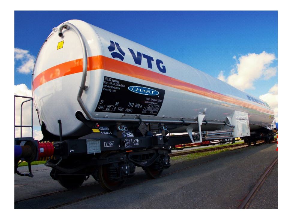
Chart teamed up with VTG, a leading rail logistic company, to develop cryogenic tank cars for the European network