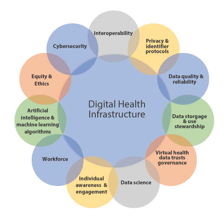
Figure 2. Infrastructure requirements for progress in digital health

With potential applications of digital health technology of the breadth noted above, certain operational preconditions must be met, both to facilitate attainment of the potential and to safeguard against possible risks. Figure 2 offers a graphic representation of the facilitative and governing infrastructure required to steward the development and application processes.