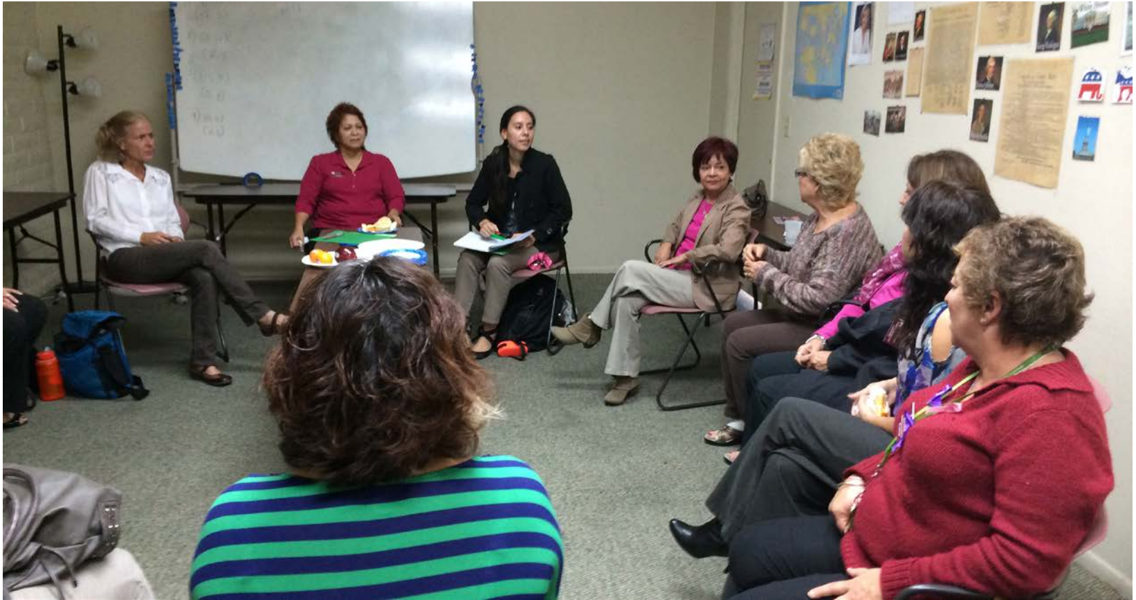
Mariposa Community Health Center, Nogales, AZ