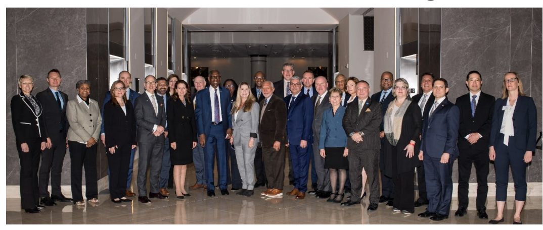
Feb. 23, 2023, UAG Meeting