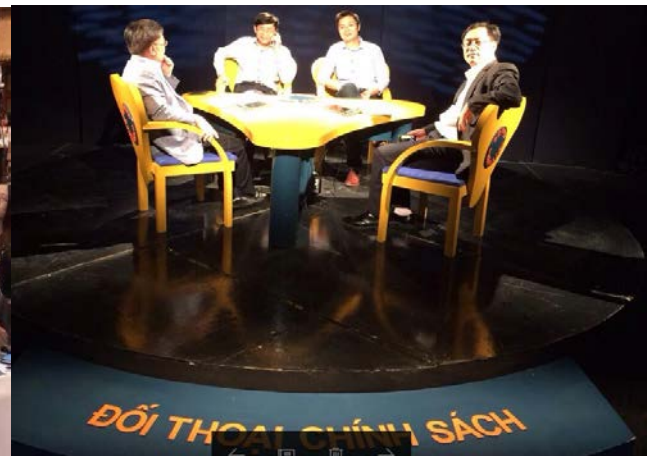
widely discussed in media