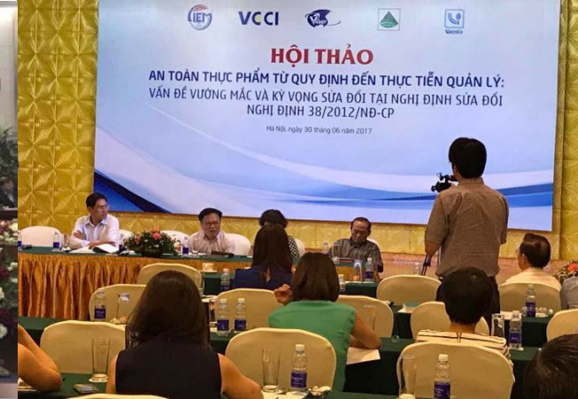
Supported by several symposia chaired by VCCI