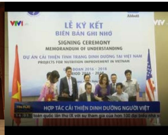
MOU signing ceremony in the National TV