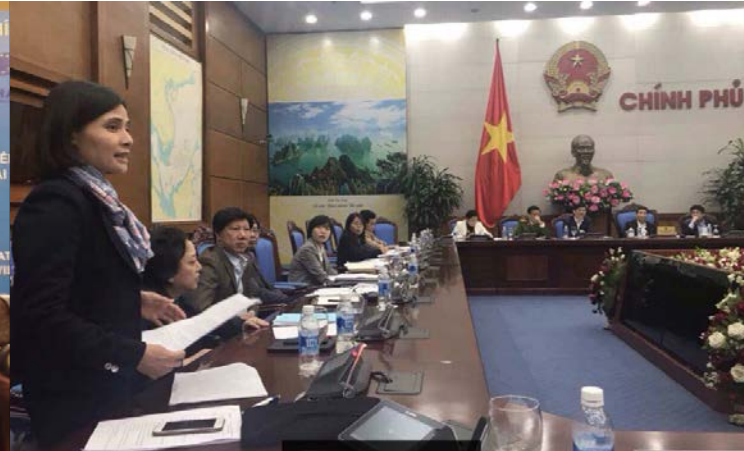
VCCI/CIEMs raised the need of improving Food Safety Regulations in the Government Cabinet Meeting