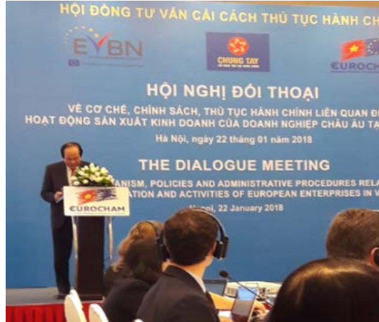
Industry discussed Food safety improvement in the Dialogue meeting of Government Consulting Committee of Reforming Administrative Procedures