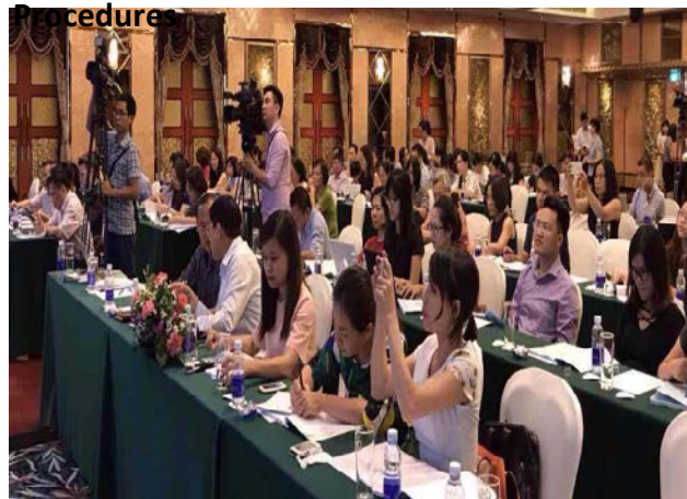
with lot of participants from authorities & industry