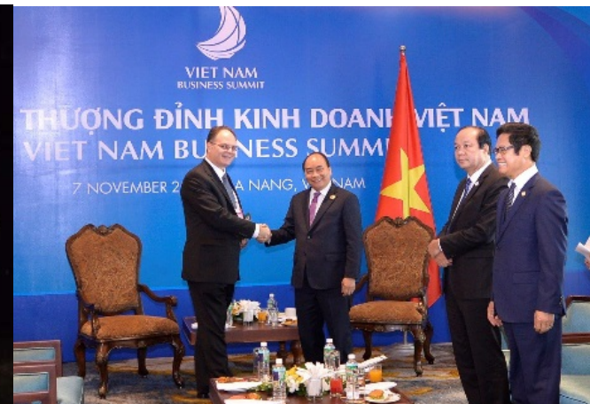
Industry met with Prime Minister during Vietnam Business Summit