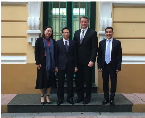
Meeting with DPM Vu Duc Dam on Mar 18, 2016