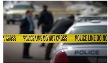
Law Enforcement (LE) Reports