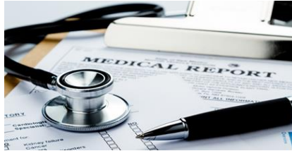
Coroner/Medical Examiner (C/ME) Reports