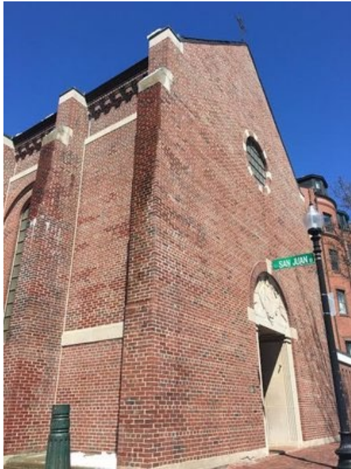
St. Stephen's Episcopal Church, Boston, MA

Community institutions that help residents prepare for (and respond to) extreme weather events.