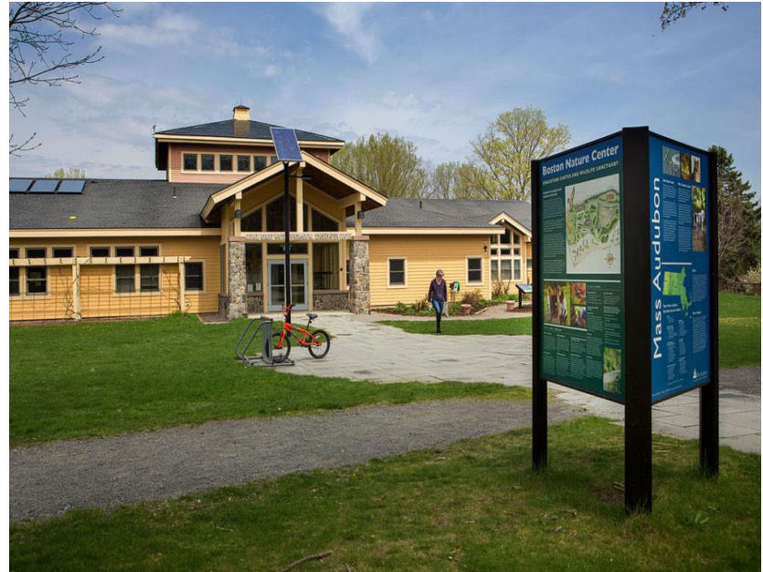
Boston Nature Center, Mattapan