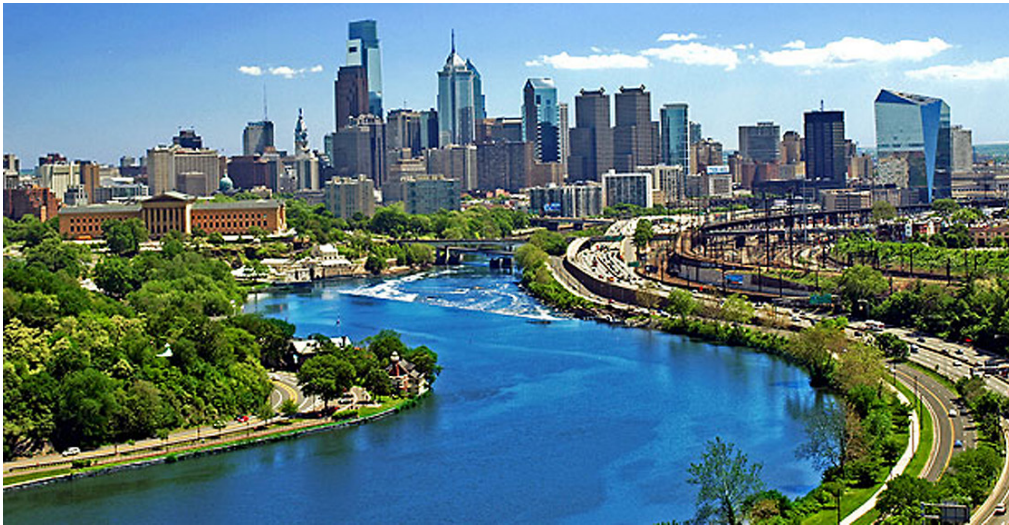
Schuylkill River, Philadelphia, Pennsylvania.