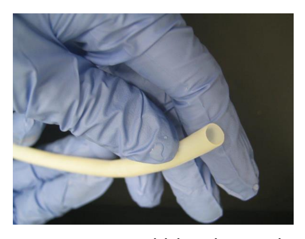
Bioengineered blood vessel