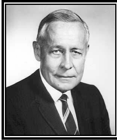
DR. ROGER REVELLE (1909 – 1991)

For almost half a century, Roger Revelle was a leader in the field of oceanography. Revelle trained as a geologist at Pomona College and at U.C. Berkeley. Then, in 1936, he received his Ph.D. in oceanography from the Scripps Institution of Oceanography. As a young naval officer, he helped persuade the Navy to create the Office of Naval Research (ONR) to support basic research in oceanography and was the first head of ONR's geophysics branch. Revelle served for twelve years as the director of Scripps (1950-1961, 1963-1964), where he built up a fleet of research ships and initiated a decade of expeditions to the deep Pacific that challenged existing geological theory.