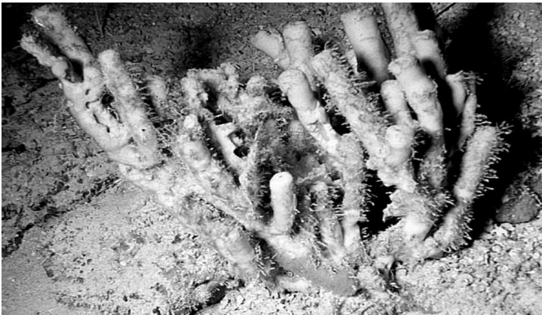
FIGURE 2 The sponge, Discodermia dissoluta , source of discodermolide, rarely occurs in shallow water, and is more commonly found at depths of 450-750 ft throughout the tropical western Atlantic region.