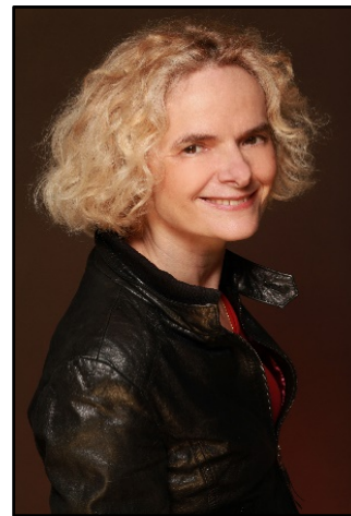
Nora Volkow, MD

National Institute of Mental Health (NIMH) National Institutes of Health