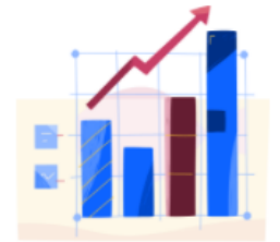
Collection and Use of Data to Drive Action