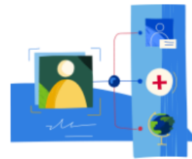
Culturally Appropriate Patient Care

Research and experience show that leading health equity strategies cut across six levers of transformation within health care organizational structures.