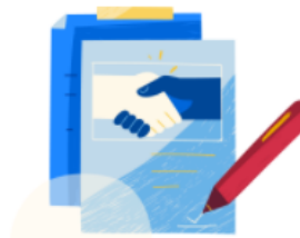
Diverse Representation in Leadership and Governance