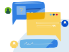
Community Collaboration for Solutions