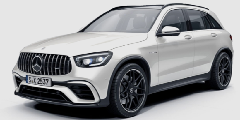
world's first CO2Made auto parts