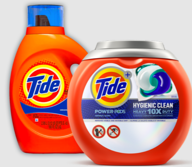
world's first CO2Made ingredients for Tide