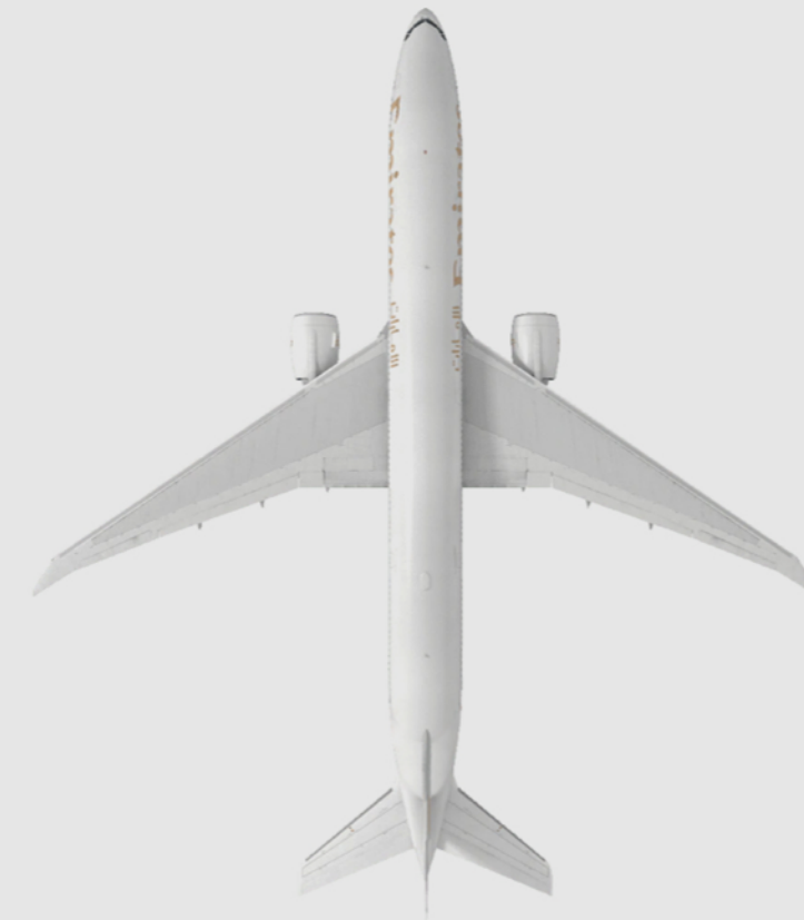
world's first jet fuel made from CO2