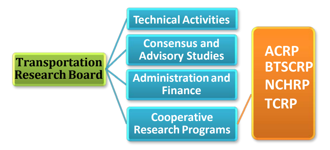
Figure 2. CRP's relationship to TRB.

The Transportation Research Board (TRB) is a division of the Academies. Figure 2 shows CRP's relationship to TRB. TRB's mission is to promote innovation and progress in transportation through research. In an objective and interdisciplinary setting, TRB facilitates the sharing of information on transportation practice and policy by researchers and practitioners; stimulates research and offers research management services that promote technical excellence; provides expert advice on transportation policy and programs; and disseminates research results broadly and encourages their implementation. TRB's varied activities annually engage more than 7,000 transportation professionals from the public and private sectors and academia, all of whom contribute their expertise in the public interest.